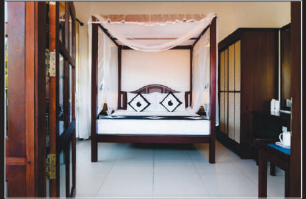
Amal Beach Hotel